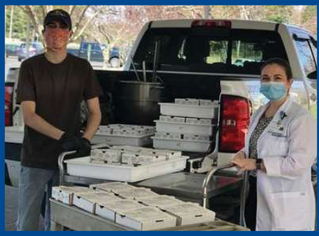
125 Pizzas delivered to a local hospital staff, 6 staff were employed for the day at the local restaurant.

Northland recently donated meals to many different first responder agencies over the past few months to provide organizations a little relief from all the important work they are doing during this pandemic, and to support local restaurants. "Our first responders risk their lives during normal times, and now even more so - we certainly appreciate them and what they are doing for our communities", said Pete Dzuris, President and CEO of Northland.