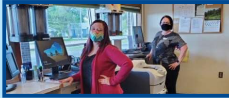
Northland Tawas branch team members working the drive-thru

In recognition of the challenges that essential front-line team members face as they continue to support the critical financial needs of our members, Northland provided a temporary wage increase for team members who actively reported to work during that time.